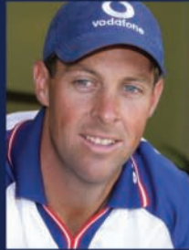
Marcus Trescothick Cricketer