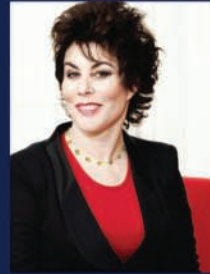
Ruby Wax Comedienne